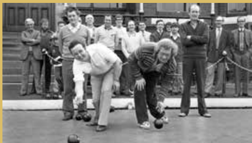
Accrington & District Bowling League 1979