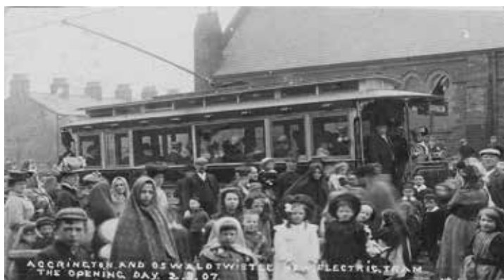
Picture from a post card dated August the 7th, 1907 by Bathurst of Blackburn.

The opening, was recorded by 'OLD HAND' describing the events of the day as follows; -