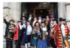
SOME OF T'OTHERS

SATURDAY 14TH MAY 2PM TO 5PM CHURCHFIELD HOUSE