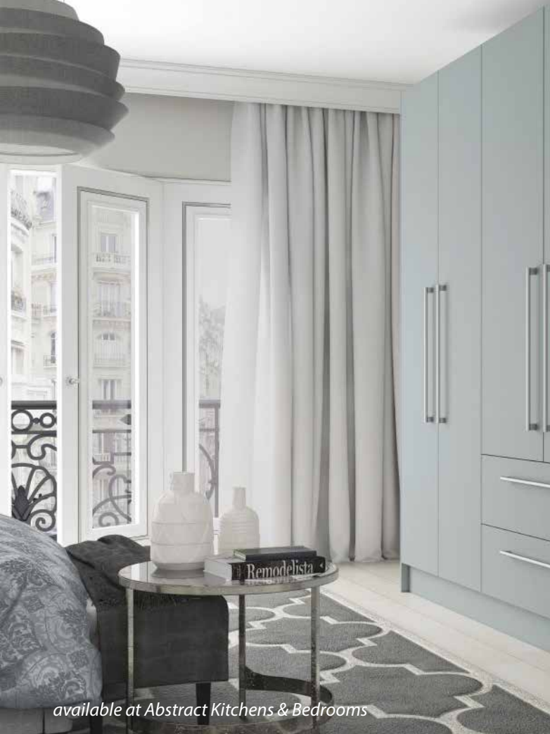
available at Abstract Kitchens & Bedrooms